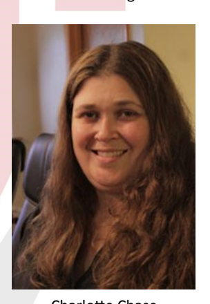
Charlotte Chase Solutions Integrator