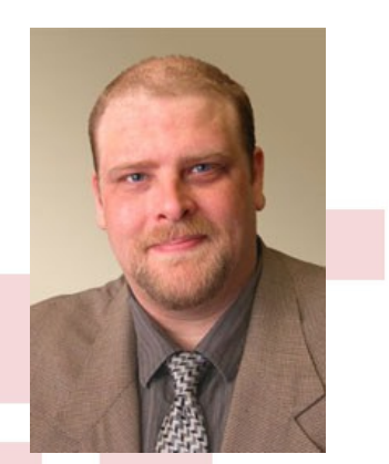
Chris Chase Solutions Integrator

Emergency support is availiable during these times.