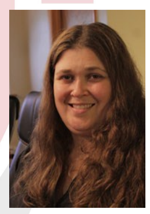
Charlotte Chase Solutions Integrator